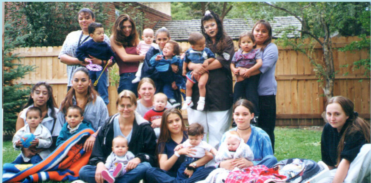
caption (above left); caption (above right); caption (below)